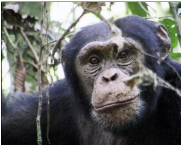
Marius, the highest ranking male in a society of Tai-Chimpanzees.