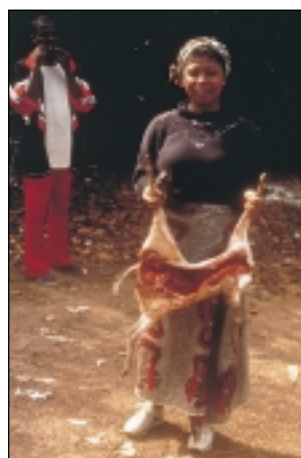
Market women offer duiker for sale.

During the last few years the supply of bushmeat in urban centers has doubled due to the growing demand. Most bushmeat on offer is forest antelope and rodents. Small animals are sold whole, larger ones in pieces, some even alive like the pangolin. On some markets the bushmeat is freshly prepared as a meal.