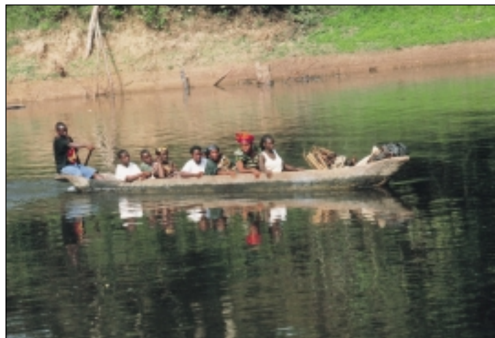
Every Friday, 15-20 boats dock at small ports in the Ivory Coast with bushmeat from Liberia. Liberia is a war zone and this weekly market is frequently the only source of income for these people.

Regional animal existence and food preferences affect supply and demand. Price differences between domestic and bushmeat vary; in larger towns domestic is mostly cheaper than bushmeat, and in forest villages it is more expensive.