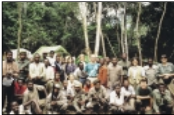
International collaboration (here the team for a large mammal census in Kahuzi-Biega National Park) promotes understanding and moves projects onwards.