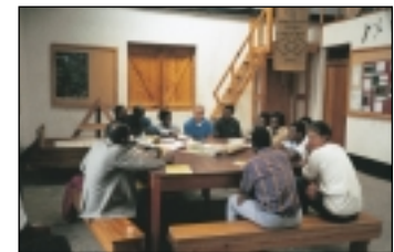
Workshops provide skills for conservation strategies.