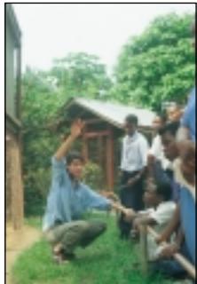
Environmental education, Drill-Ranch/Nigeria.

„Sustainable Development“ (= mutual striving for economic wealth, social equality and protection of natural living resources). This was already demanded by the IUCN in 1980 and again by the UN-Conference for Environment and Development in 1987 and 1992 (Agenda 21). In 1996, however, the IUCN stated that projects on sustainable development so far have shown to be economically dependent in various ways, to be unpredictable and often harmful to nature.